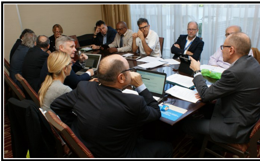
MEETING OF THE PRESIDENCY COMMITTEE SANTIAGO DE CHILE Saturday 11 th , Sunday 12 and Wednesday 15 November 2017