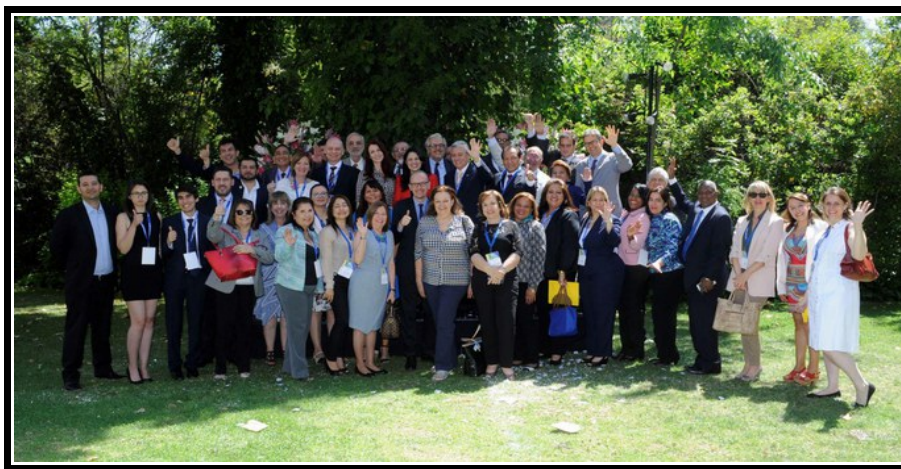
MEETING OF THE IBA GROUP – SANTIAGO DE CHILE Sunday, 12 th November 2017