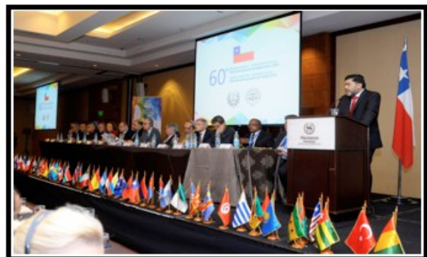
Opening Ceremony of the 60 th Annual Meeting of the IAJ in Santiago de Chile on 13 th of November, 2017