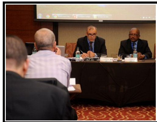
MEETING OF THE AFRICAN GROUP – SANTIAGO DE CHILE Sunday, 12 th November 2017