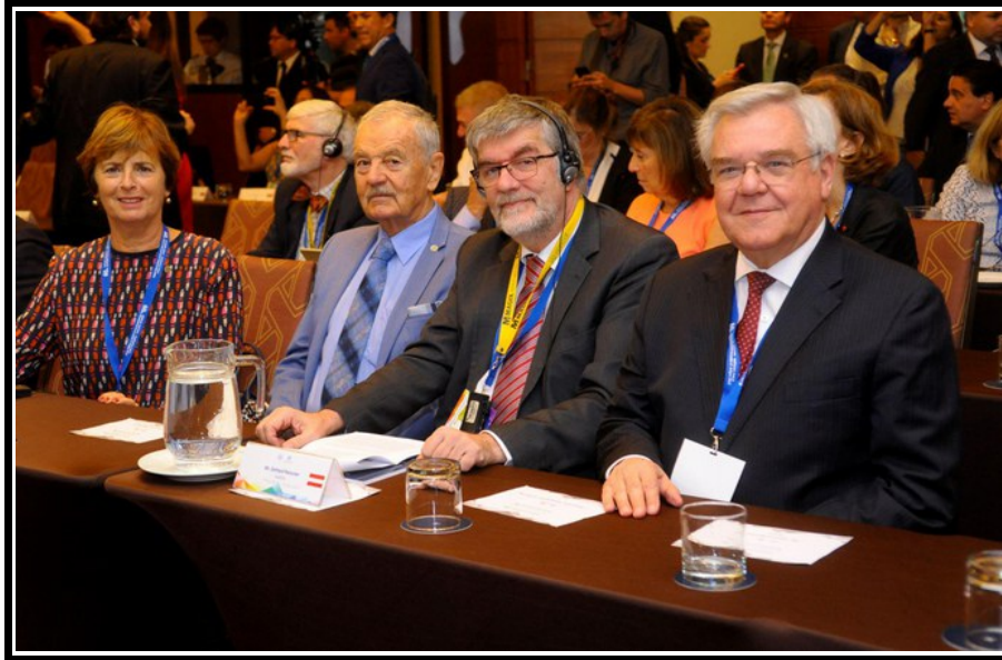
IAJ's Honorary Presidents attending the meeting in Santiago de Chile

They are accessible under the following URL: https://www.flickr.com/photos/magistradosdechile/albums