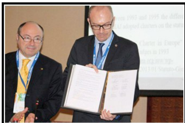
Ceremony for the Signature of the new IAJ Universal Charter of the Judge, in Santiago de Chile, on the 14 th of November, 2017