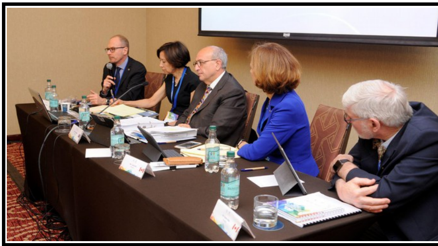
MEETING OF THE ANAO GROUP – SANTIAGO DE CHILE Sunday, 12 th November 2017