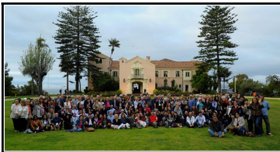
MEETING OF THE CENTRAL COUNCIL – SANTIAGO DE CHILE (CHILE) Monday 13 th , Tuesday 14 th and Thursday 16 th November 2017