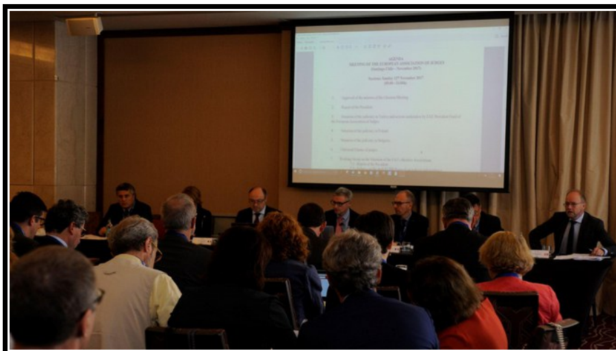
MEETING OF THE EUROPEAN ASSOCIATION OF JUDGES – SANTIAGO DE CHILE Sunday, 12 th November 2017