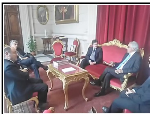
UN SPECIAL RAPPOREUR AND IAJ SG RECEIVED BY THE ITALIAN GENERAL PROSECUTOR