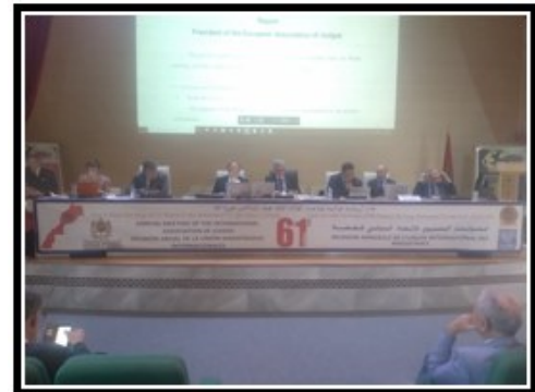
The four IAJ Regional Groups met in Marrakesh on October 14 th .

https://www.iaj-uim.org/iuw/wp-content/uploads/2018/10/EAJ-resolution-on-Poland_MArrakech-2018.pdf